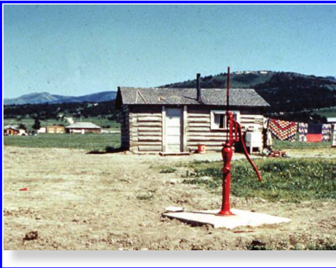
Part of the genius of the Indian Health Service is the incorporation of provision of safe water with clinical services.