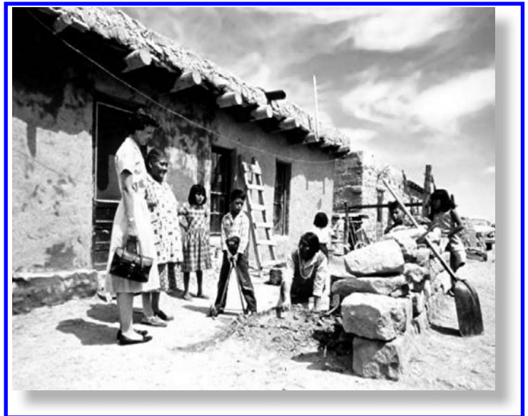
Home visits by public health nurses have long been mainstays of American Indian and Alaska Native health care.

Until the mid-19th century, administration of health services for AI/AN persons was neither systematic nor organized into a single program. With the 1849 transfer of Indian affairs from the US Department of War to the newly established US Department of the Interior, federal