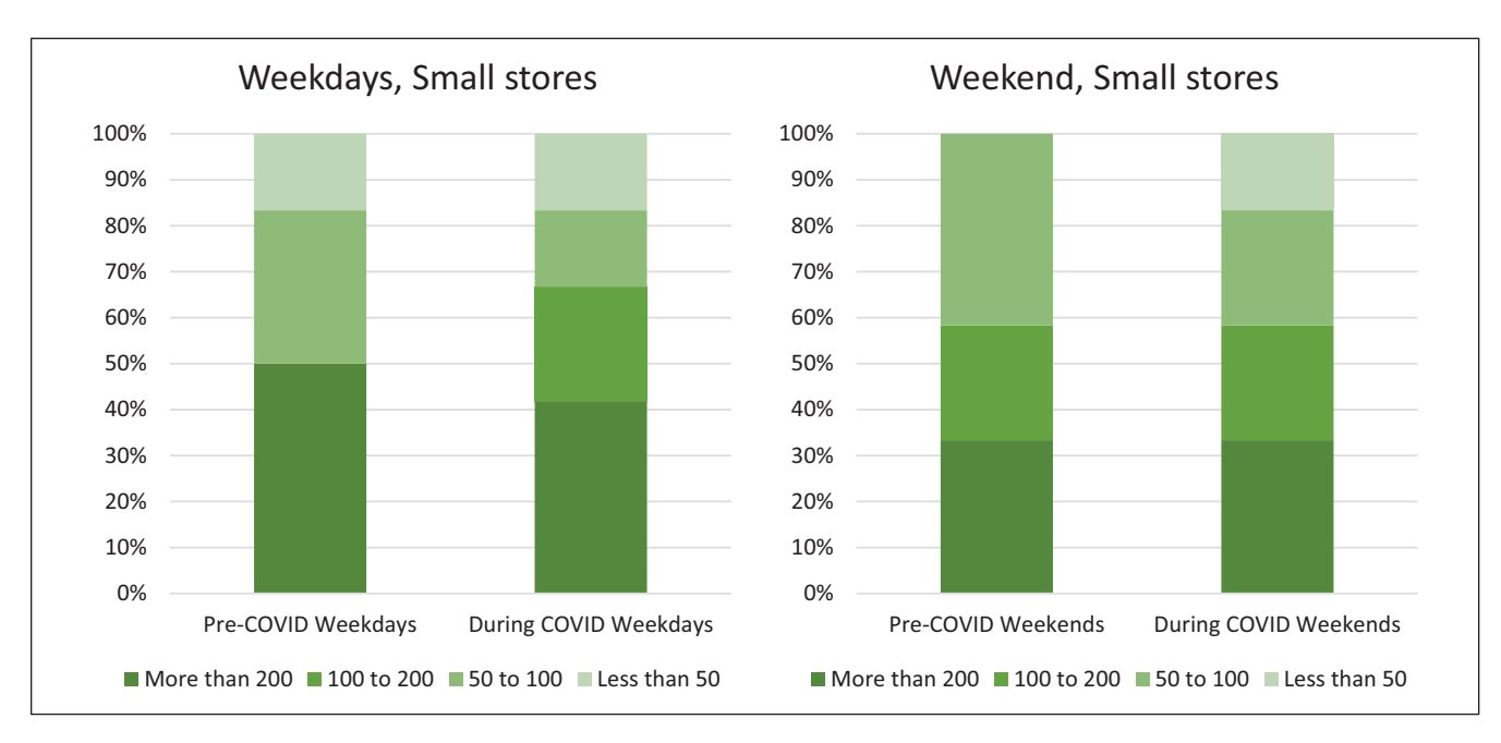
FIGURE 1 Customer Volume for Small Stores on Weekdays and Weekends Based off Percentages Pre-COVID and During COVID